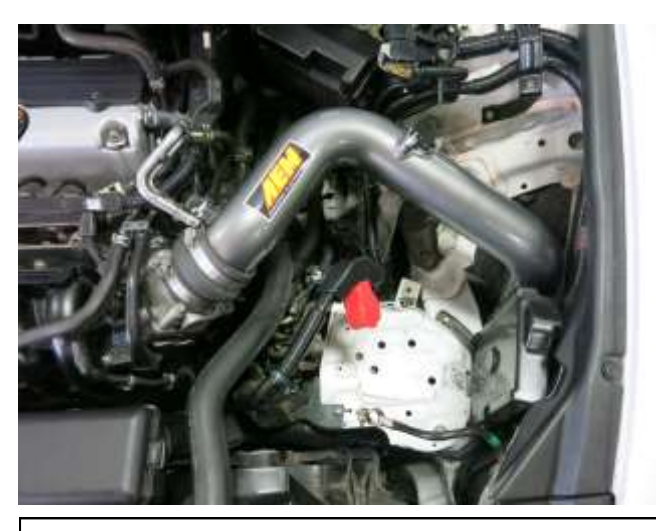
f. Install the intake tube by inserting the bracket to the nut/bolt combo from step 3d first, then into to the coupler. DO NOT TIGHTEN THE CLAMP AT THIS TIME.