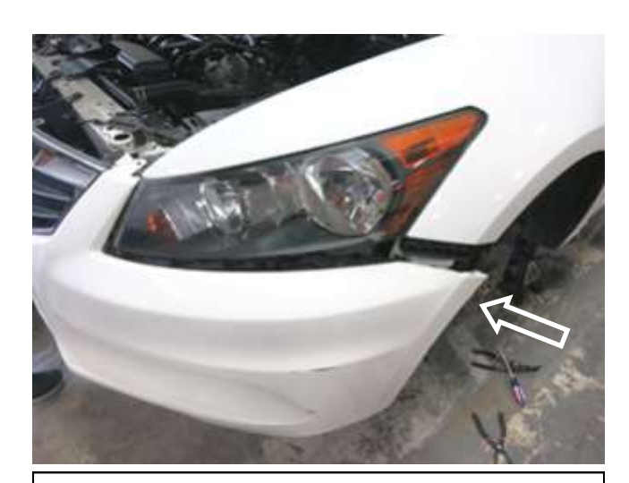
h. Remove all 10mm push clips to remove the bumper to access the resonator by gently pulling the bumper by the wheel well as shown.