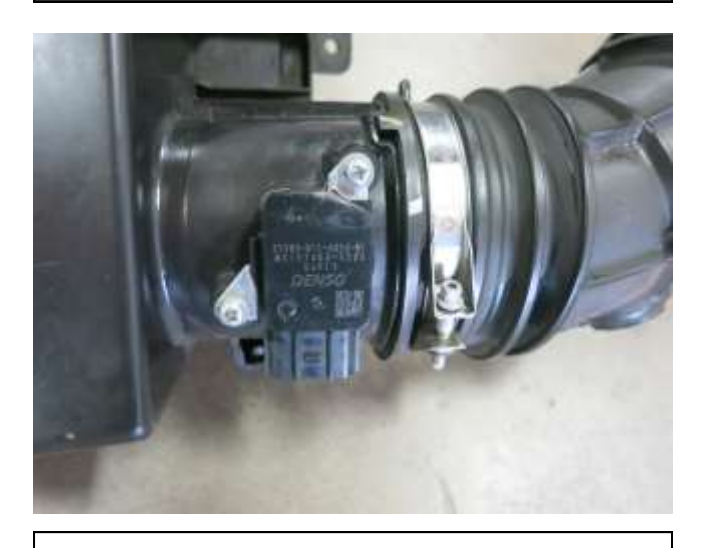
j. Remove the MAF sensor from OE air box. NOTE: MAF SENSOR WILL BE REINSTALLED IN STEP 3e.