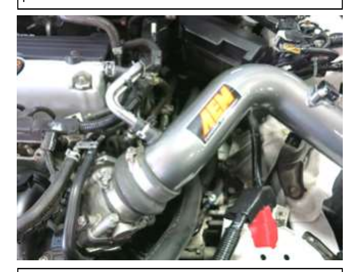
h. Install the supplied PCV nipple to the intake tube then install the PCV line into it. Secure the PCV line with spring clamp from step 2 d.