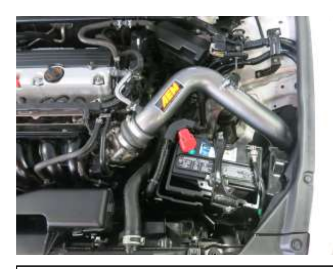
k. Tighten all hose clamps and Install the battery and battery strap and reconnect both battery cables.