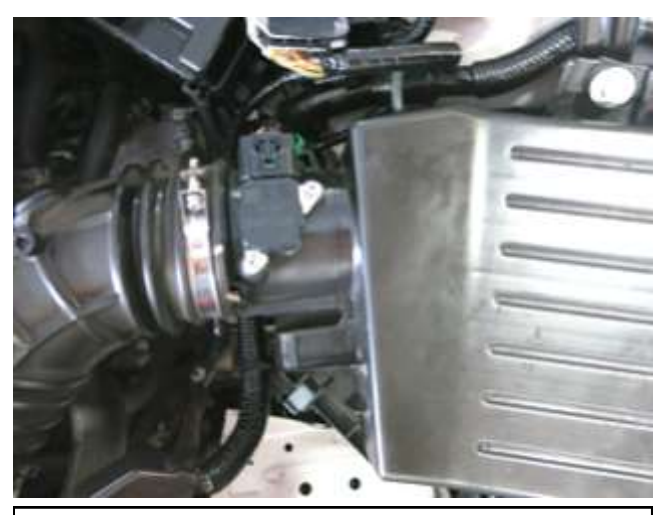
c. Disconnect the mass air flow sensor connection by depressing the clip on the plug and gently pull away.