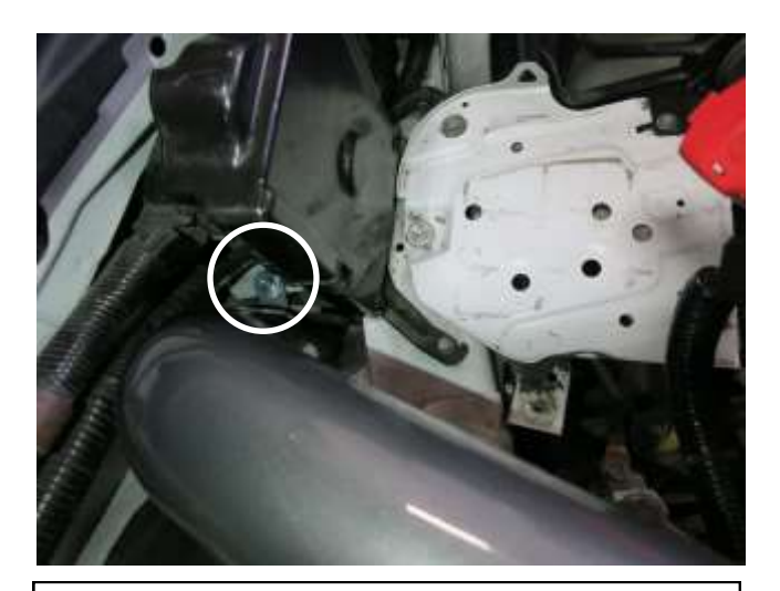
g. Align tube for best fit before tightening the nut/bolt combination.