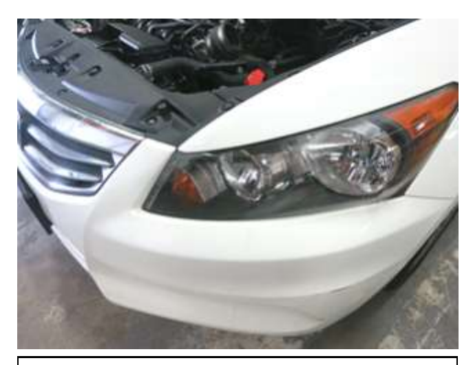
a. Align the front bumper and push into the tabs that support the bumper. Then install all 10mm push clips on the bottom of the bumper.

a. When installing the intake system, do not completely tighten the hose clamps or mounting hardware until instructed to do so.