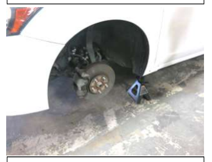
g. Jack up and support vehicle safely with jack stands. Remove the driver side wheel and pull inner fender to access intake resonator for removal by removing the 10mm push clips.