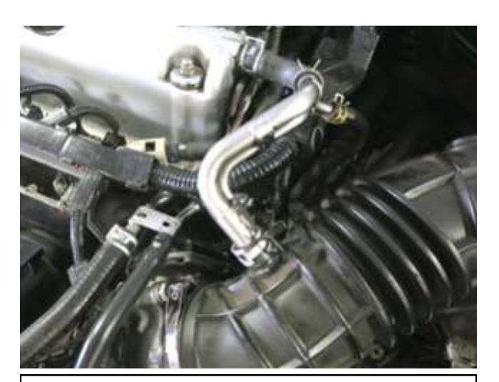
d. Disconnect the PCV line from the OE intake tube by squeezing the spring clamp. NOTE: CLAMP WILL BE RE-USED IN STEP 3h.