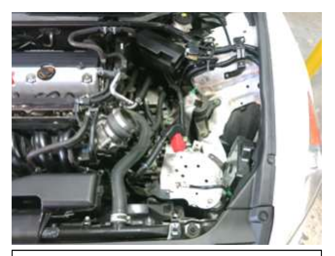
c. Install the coupler onto the throttle body and tighten only the clamp on the throttle body at this time.