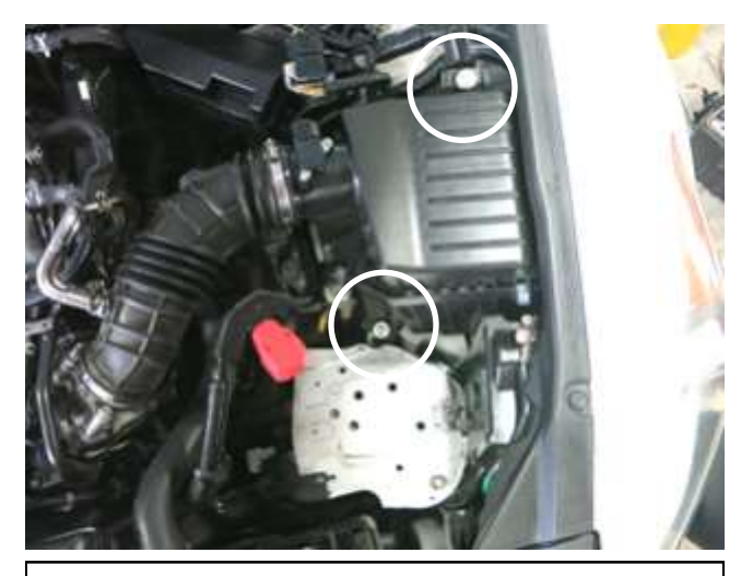
e. Loosen the throttle body clamp and remove the 2 6mm bolts that secure the air box, then remove the complete air box assembly from vehicle.