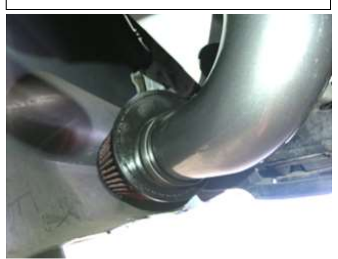
j. Install the AEM Dryflow filter as shown. NOTE: IT MAYBE NECESSARY TO ROTATE THE FILTER UNITL IT CLEARS ALL NEARBY COMPONENTS.