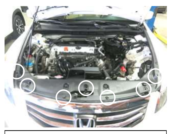
f. Remove the core support cover by releasing the 7 10mm clips.