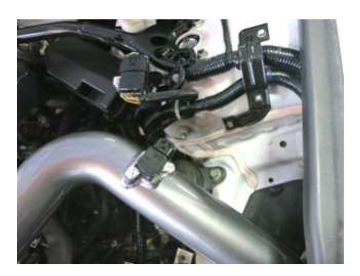
i. Connect the MAF sensor wire harness.