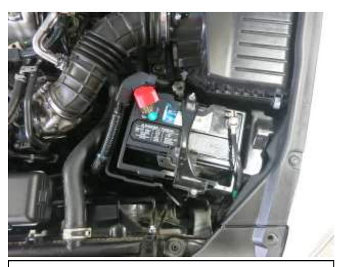
a. Disconnect negative and positive battery cables from and remove the battery strap by loosening the 10mm nuts.