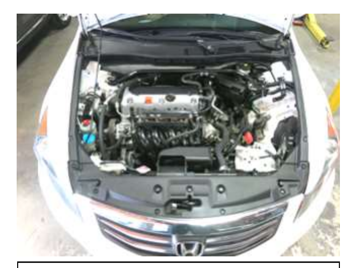
b. Install the core support cover by inserting the 7 10mm clips.