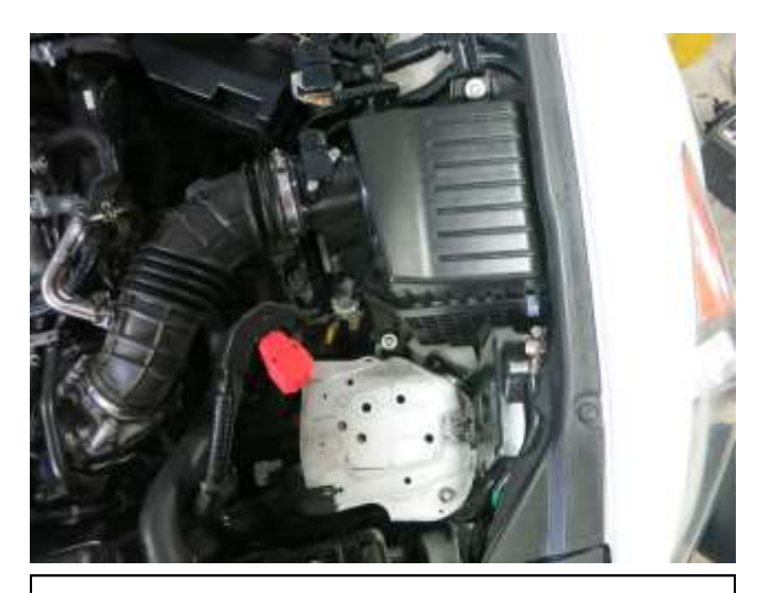
b. Remove the battery and battery strap from the vehicle.