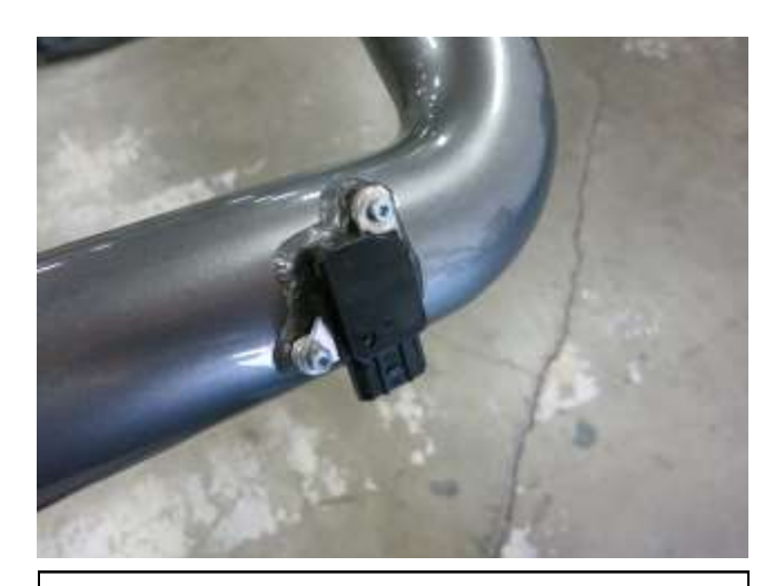
e. Install the MAF sensor onto the AEM intake tube and secure with the supplied M4 socket head bolts.