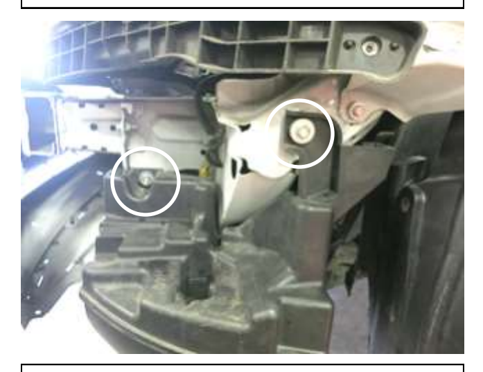
i. Remove the 2 bolts that hold the resonator and remove it from vehicle.